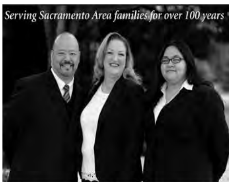
Serving Sacramento Area families for over 100 years

Is your broker ignoring you? Let's talk.